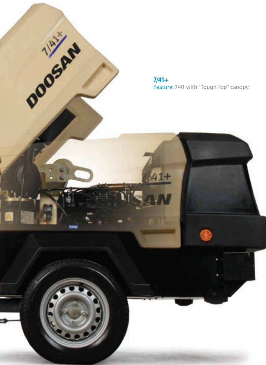
7/41+ Feature: 7/41 with "Tough Top" canopy.

Serviceability is excellent, with easy access to all maintenance points . All areas have been carefully designed for ease of inspection, maintenance and repair. Service intervals for different compressor components have been rationalized to reduce associated costs for the customer and increase utilization in the plant hire industry.