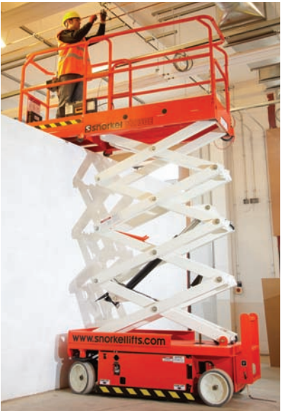
S1930E/S1932E The Snorkel S1930E delivers a working height of up to 7.6m and a platform capacity of 227kg. Compact and nimble, the S1930E has an inside turning radius of less than 130mm and can climb slopes of 25%. The S1930E is just 0.76m wide, so can easily pass through a standard European doorway. For additional flexibility, the S1932E is just 50mm wider, but 30kg lighter and is rated for outdoor use by one person.