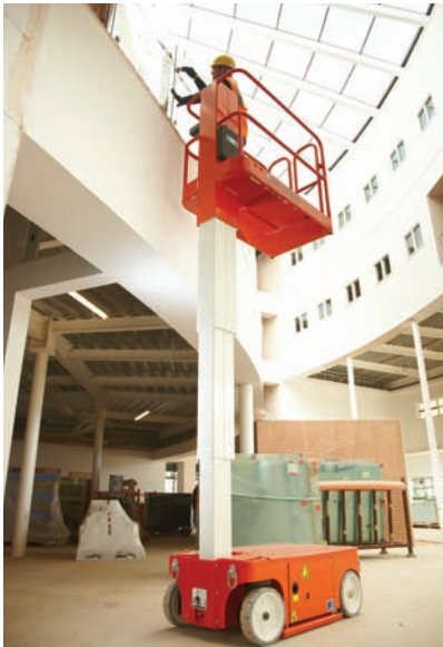
M1230E The original self-propelled telescopic mast lift remains popular the world over for its versatility, strength and durability. The Snorkel M1230E can be driven through standard doorways and carried in passenger elevators - yet will still lift two people with tools to a safe working height of 5.6 metres. It is ideal for a wide range of applications from construction and maintenance to retail.