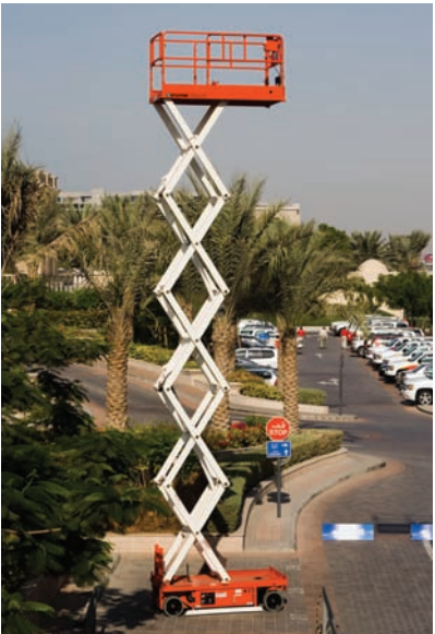
S2632E/S2646E/S3246E Designed for indoor construction and maintenance tasks, the S-E series electric scissors offer working heights up to 12m. The 10m working height model is available in a 0.81m wide version for confined spaces and a 1.16m wide version when more working area is required. Ideal for facilities maintenance, both the S2646E and S3246E can be used outdoors with a single operator on the platform.